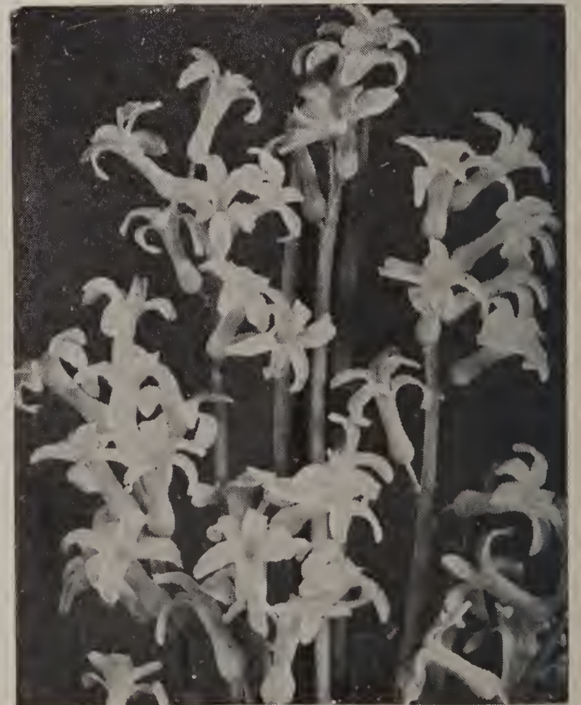
French Roman Hyacinths

YELLOW HAMMER. 1. A fine yellow variety for pot-culture. Creamy yellow, with a well-filled truss of large bells.